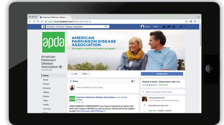
Coming soon: APDA's brand will be launched online at apdaparkinson.org , along with our new and improved social channels.

To further illustrate the urgency of APDA's work, a new logo and tagline were designed to reflect APDA's dual mission to serve those impacted by Parkinson's disease and support innovative research to uncover the causes, treatment and a cure for this disease.