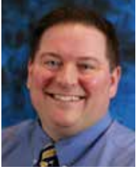
Associate Professor, Department of Neurology Director – Deep Brain Stimulation Research Program Medical School, University of Minnesota